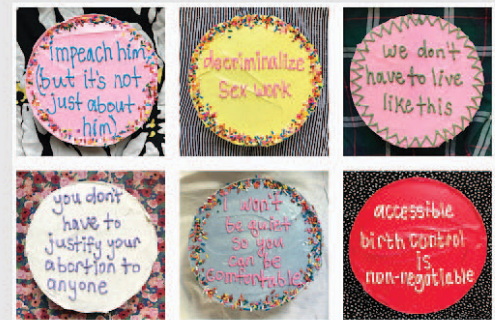
Figure 2: Instagram Posts