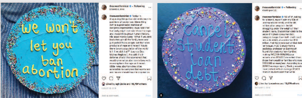
Figures 4-5: Instagram Posts re. Abortion and Student Loan Debt