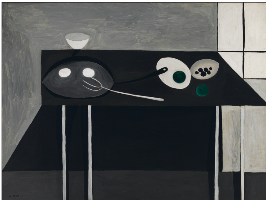
Figure 3: William Scott, Still Life (1951). © Estate of William Scott 2022. Reproduced by permission of the copyright holder.