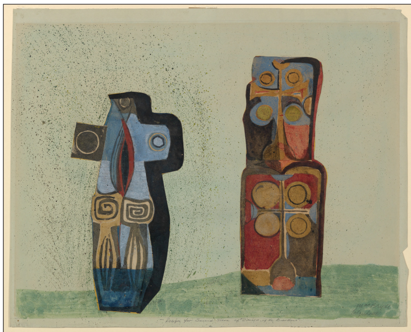
Figure 2: Robert Colquhoun and Robert MacBryde (1951) Design for Second Scene for Donald of the Burthens [collage, watercolour, ink, and gouache on medium weight, slightly textured, light green paper, sheet], Smith College Museum of Art, Northampton, Massachusetts.