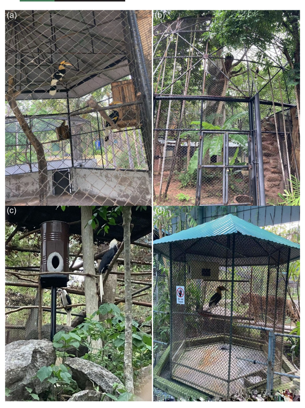
FIGURE 3 Hornbill exhibits at zoos in Thailand and their welfare scores in parentheses (out of a maximum of 26): (a) Great Hornbill exhibit at a government zoo (12); (b) Hornbill exhibit at an accredited zoo (23); (c) White Crowned Hornbill exhibit at an accredited zoo (20); (d) Great Hornbill exhibit at a private zoo (7).

concerned reproductive behavior or physical characteristics. In terms of signage condition, a minority (n=13) were in a poor state, that is, faded, broken, or so dirty that signs were difficult to read. We found a range of different styles and quality signs (Figure 3); most were of durable quality made from PVC or aluminum, but some were made of paper.