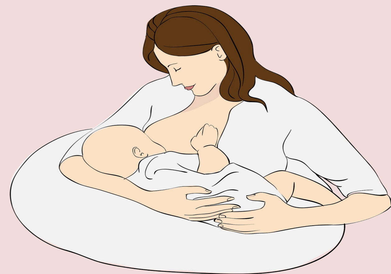
Fig. 1 Mother breastfeeding a baby