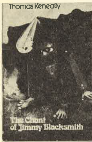
ANGUS AND ROBERTSON