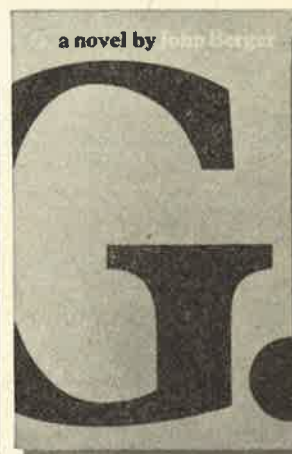
WEIDENFELD &amp; NICOLSON