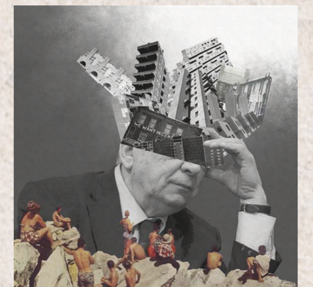
Desire for Emotionally Stimulating Social Housing