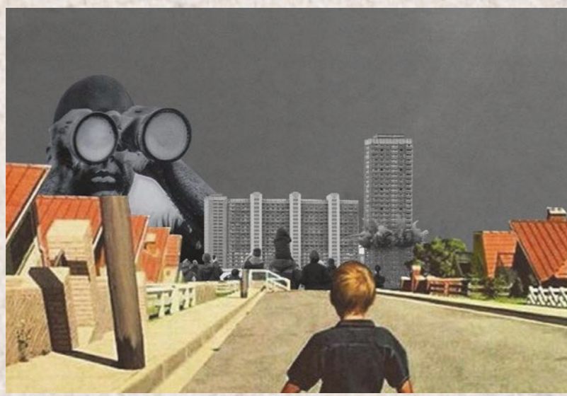
Architecture being our Connection to our Surroundings

We now yearn for something much more than just a roof over our heads, we now desire: