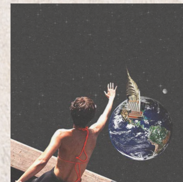
Architecture being our Connection to our Surroundings

We must strive to move forward as a whole [society], not just as a fraction of our selves.