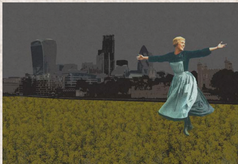
Architecture being our Connection to our Surroundings

The definition of what brings joy to our lives is an ever-changing construct, made evident when looking at the changing understanding of what defines 'quality of life' throughout history.