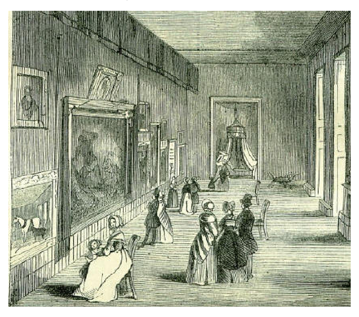
This engraving of the interior of the Gallery in the 1830s renders it clear that Guerin was the source.

The account went on to describe a landscape background which can only be that of Guerin's picture. It is weirdly florescent in tone. The 'glare of lightening' was mentioned and the way it give a 'fiery hue' to Cain's nude body. The description focused upon the distinctive colour scheme of the needlework; rendering it clear that it must have been based upon a close study of the hues of the original picture at the Luxembourg Gallery. In about 1820, when Linwood commenced the needlework, there was no print of this picture. She must have gone to Paris to study it. Guerin's Fuite de Cain was gigantic, twelve by nine feet. Engravings of the needlework copy when in place in the Linwood Gallery suggest it was of the same size. No surprise, then, that it took more than a decade to make, as was claimed in Linwood's publicity material. The Judgement became an icon of creative and evangelical stamina.