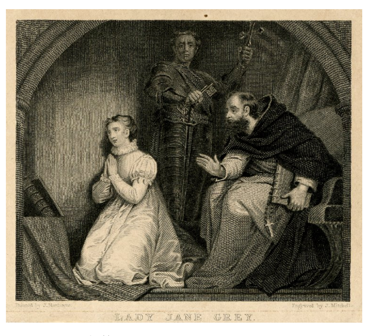
Old Testament examples of masculine intemperance

This picture of Lady Jane Grey had paradoxical inflections. Its superficial purpose was to demonstrate Linwood's personal identification with a Protestant princess; it being no accident that Lady Jane Grey was well-known for cultivating the accomplishment of needlework.xcvi However, the whole theatre of presentation, which was one of histrionic female martyrdom, was unmistakably Catholic in sentiment.