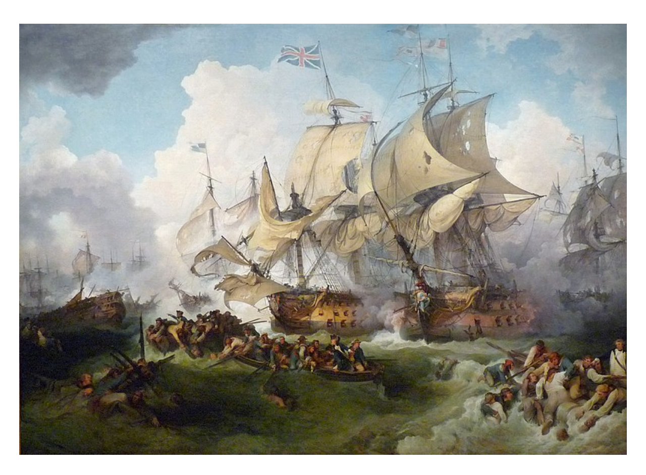
Philip de Loutherbourg, Lord Howe's action on The Glorious First of June, 1795

During the Revolutionary and Napoleonic Wars, many of those who staged commercial art exhibitions in London aimed to deliver a thunderous sensory impact. Such was the pictorial re-enactment, by P-J de Loutherbourg, entitled Earl Howe's Victory over the French Fleet, June 1, 1794, which was shown at the Historic Gallery in Pall Mall in March 1795. In wartime London such explosive pictures were regarded as appropriately stirring entertainment. This was not the most obvious environment in which one might expect the viewing of needlework, with little patent connection to war, to emerge as a jingoistic thrill. However,