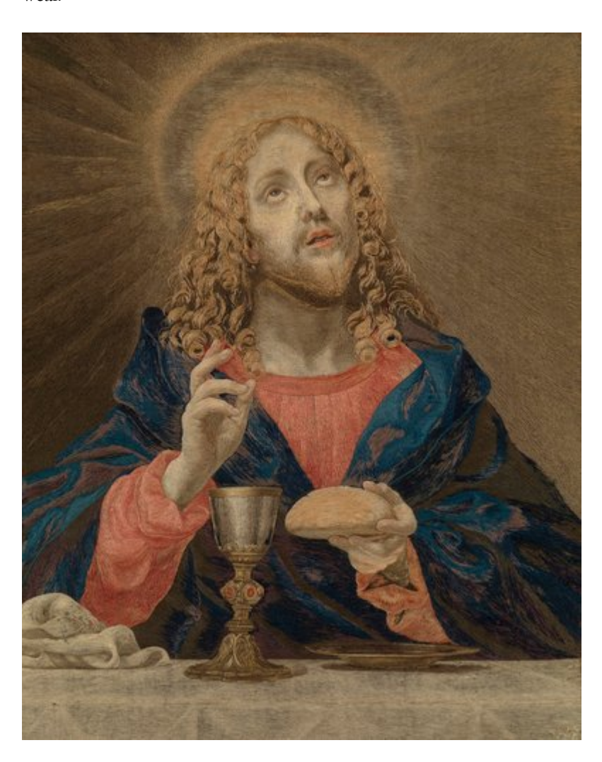
Linwood's famous Salvator Mundi, which is now in the Royal Collection

Although her strange form of theatre was conspicuously emotive, any release of feeling was bound by constraints of propriety. Decorousness was achieved, in part, by creating areas with a carefully crafted church-like setting. Between 1789 and 1831, Linwood steadily added to the number of devotional works in her exhibitions. Indeed, by its latter stages, the Linwood Gallery had a scripture room. In forming this dimension to her needlework shows, Linwood anticipated the deployment of religiosity to generate rituals of reverence in museums. Commercially in the keyed into the requirement for entertainments that were unambiguously suitable for the edification of pious women. Indeed, she promised to help produce piously compliant women, at a time that there was a growing demand on the patriotic home front for people who seemed to answer this description. In this respect, she could, and did, claim to be 'improving' the public weal.