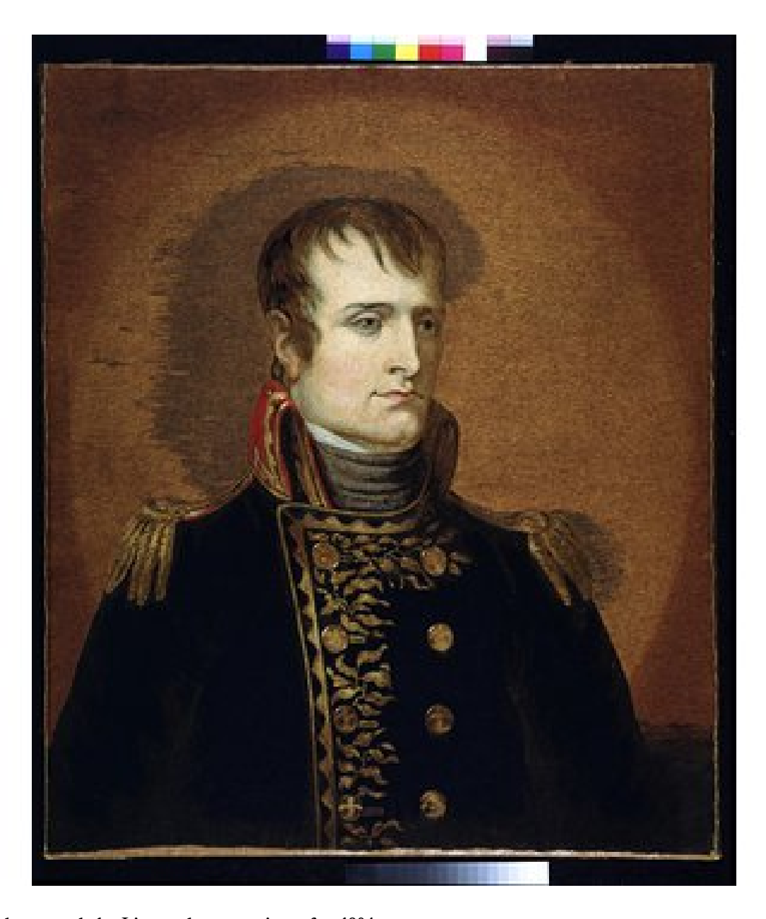
Napoleon, made by Linwood at sometime after 1804.