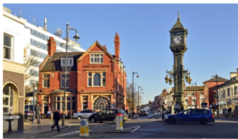
JEWELLERY QUARTER, BIRMINGHAM, UK

Cities have the capability of providing something for everybody, only because, and only when, they are created by everybody.