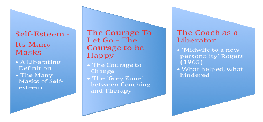
Figure 1: Super-ordinate Themes and Sub-Themes

The emerging findings from each super-ordinate theme and sub-themes are expanded upon below along with some potential recommendations. The themes are shown in Figure 1.