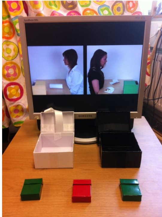
220 Fig. 1. The participants' view of the screen, boxes, and sweets, at the start of 225 the distribution phase.

In both conditions the experimenter then took out the two packets of good 225 sweets and the one packet of disgusting sweets, placed them in a row symmetrically in front of the two boxes with the disgusting sweets in the middle, and explained “You can give them the packets in their boxes, and you get to decide what they get. You decide if anyone should get the disgusting sweets and if anyone should get the good sweets. You don’t need to give 230 out all the packets. While you are doing that I’ll get some work done.” While distributing, the participant could see the onscreen final still tableau with the antisocial actor sitting by the drawing she ripped up and the neutral actor by the drawing she left whole (Figure 1). The experimenter turned so she could not see the participant, and appeared to busy herself until the participant said they were finished, asking for such an indication if she could hear they were finished but had not said so. If she heard no activity after 10 s she reminded the 235 participant “you can put into the boxes now”. The rationale for providing two packets of good sweets but only one packet of bad sweets was so as not to push children into unwillingly allocating the bad sweets: this way, allocating one packets of good sweet to each actor was an obvious possible choice; and further, provision of two packets of bad sweets might have been interpreted as encouragement to allocate them to both actors.