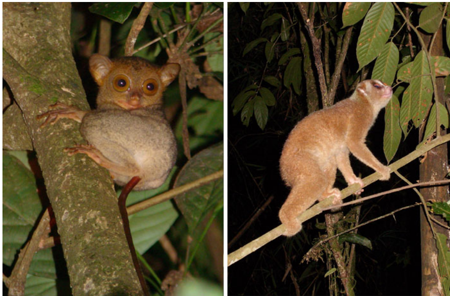
Fig. 1 Tarsius bancanus from Lower Kinabatangan Wildlife Sanctuary, Sabah, Borneo and Nycticebus coucang from Batu Tigi Protected Forest, Lampung, Sumatra. Tarsiers and slow lorises live in sympatry in both areas.

Climatic change has been implicated as a major cause for the demise of tarsiers on mainland Asia (Beard 1998). Indeed, Jablonski (2003) argued that the forests of insular Southeast Asia probably more closely resemble those inhabited by tarsiers in the Paleogene, thus explaining their persistence in this region. In examining their island distribution, Harcourt (1999) reported that in Sundaland, tarsiers ( Tarsius bancanus ) and slow lorises ( Nycticebus coucang , N. javanicus , N. menagensis ) showed a checkerboard distribution on small islands, i.e., only one or the other occurs. The smallest island where both species coexisted was Bangka,