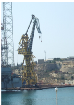
creatively adapt techniques [Iona]

Overall, coaches expressed a 'sense of difference', a need to 'find new ways to practise' (Luke), displaying an openness to learning in unpredictable coaching conditions, though few experienced the same things. Depending on past experience, some noted greater contrast with pre-pandemic praxis than others. Some faced challenges in interpreting situations involving layered meaning or unforeseen reactions, as evidenced in the image and description selected by Iris (below). The unpredictability of session flow and coachee reactions inspired adaptive creativity which Iona described through the image of a crane painted in the likeness of a giraffe.