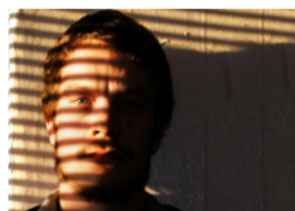
"partly in sunshine, partly in shade": unpredictable coachee reactions in-session, even with same coachee from session to session [Iris]