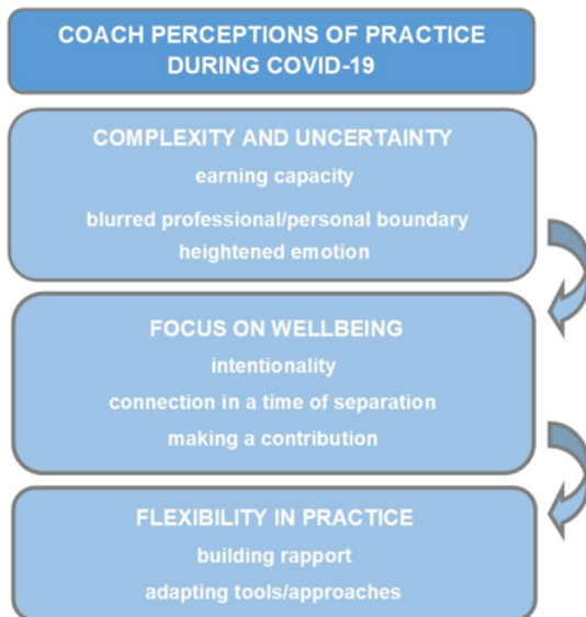
Figure 1: summary of themes and subthemes

Coaches experienced enhanced and layered complexity during the early part of the pandemic, requiring increased focus on wellbeing, which in turn facilitated adaptive capacity to manage unpredictable in-session practice. Despite coaches operating in different client contexts, applying varied coaching approaches and with differing levels of practice experience, similar views and experiences were expressed by the majority of contributors.