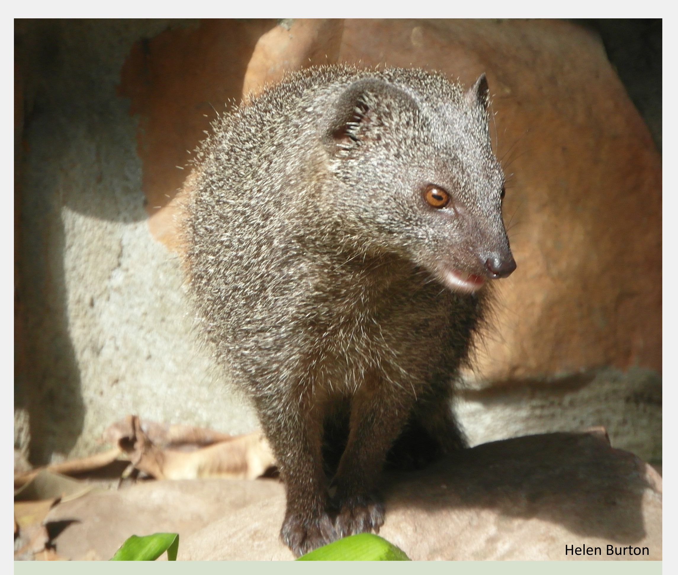
Cape grey mongoose, Galerella pulverulenta , an endemic mesocarnivore of southern Africa and potential bioindicator