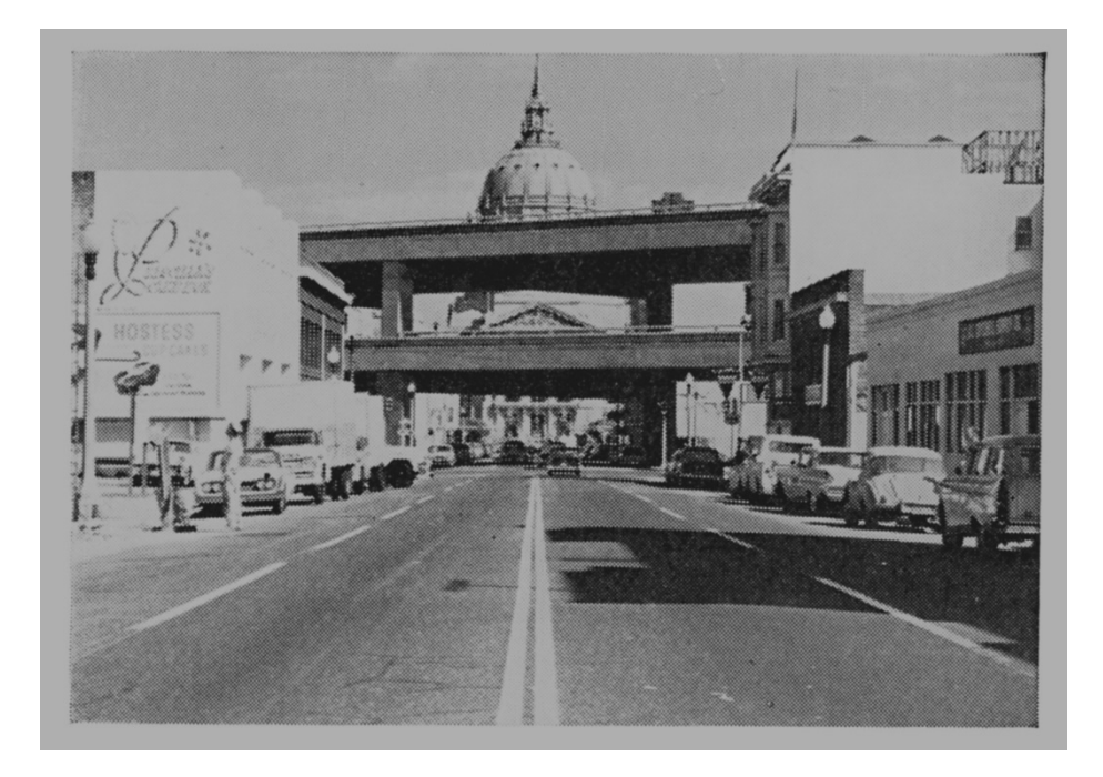
Figure 2 Double-deck elevated expressway in San Francisco, blocking view of City Hall, an example of the 'disastrous' environmental effects of expressways on cities