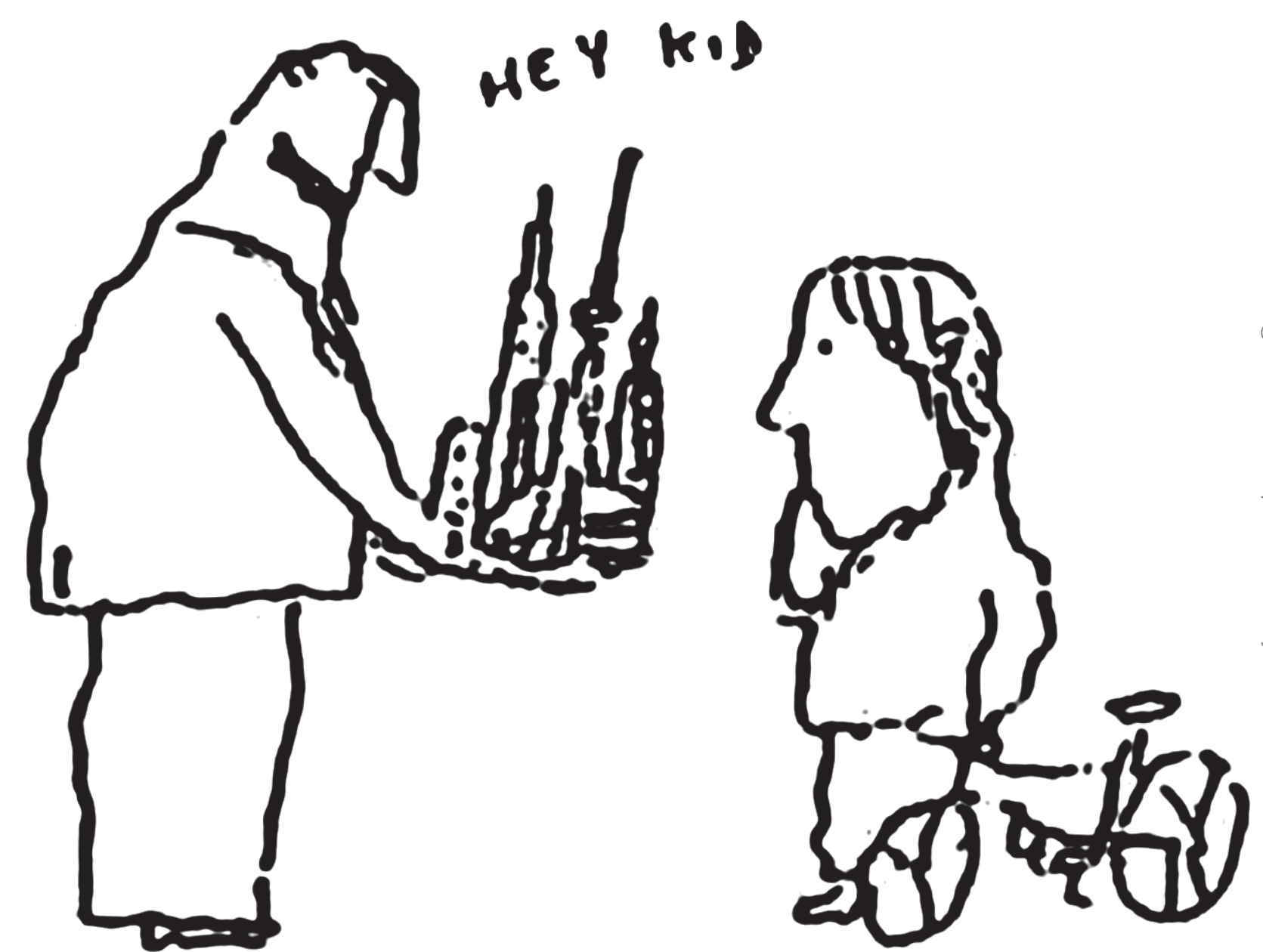
BfP News.