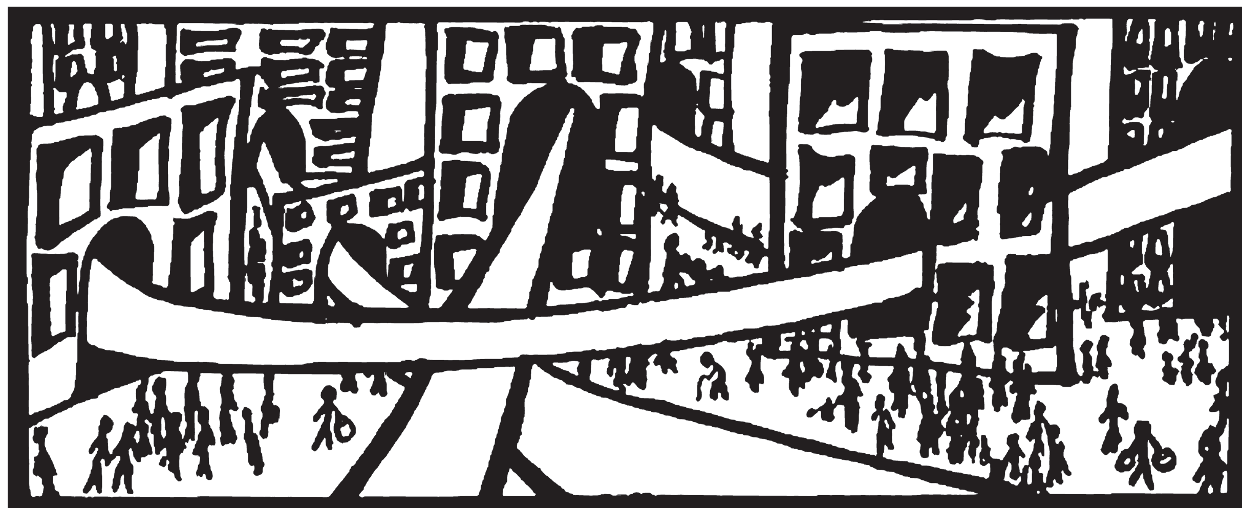
Women at the Centre report 1989.

Much of women's organizing was a response to the largescale clearance and redevelopment enabled by the post-war planning powers granted to Birmingham City Council from the central state.