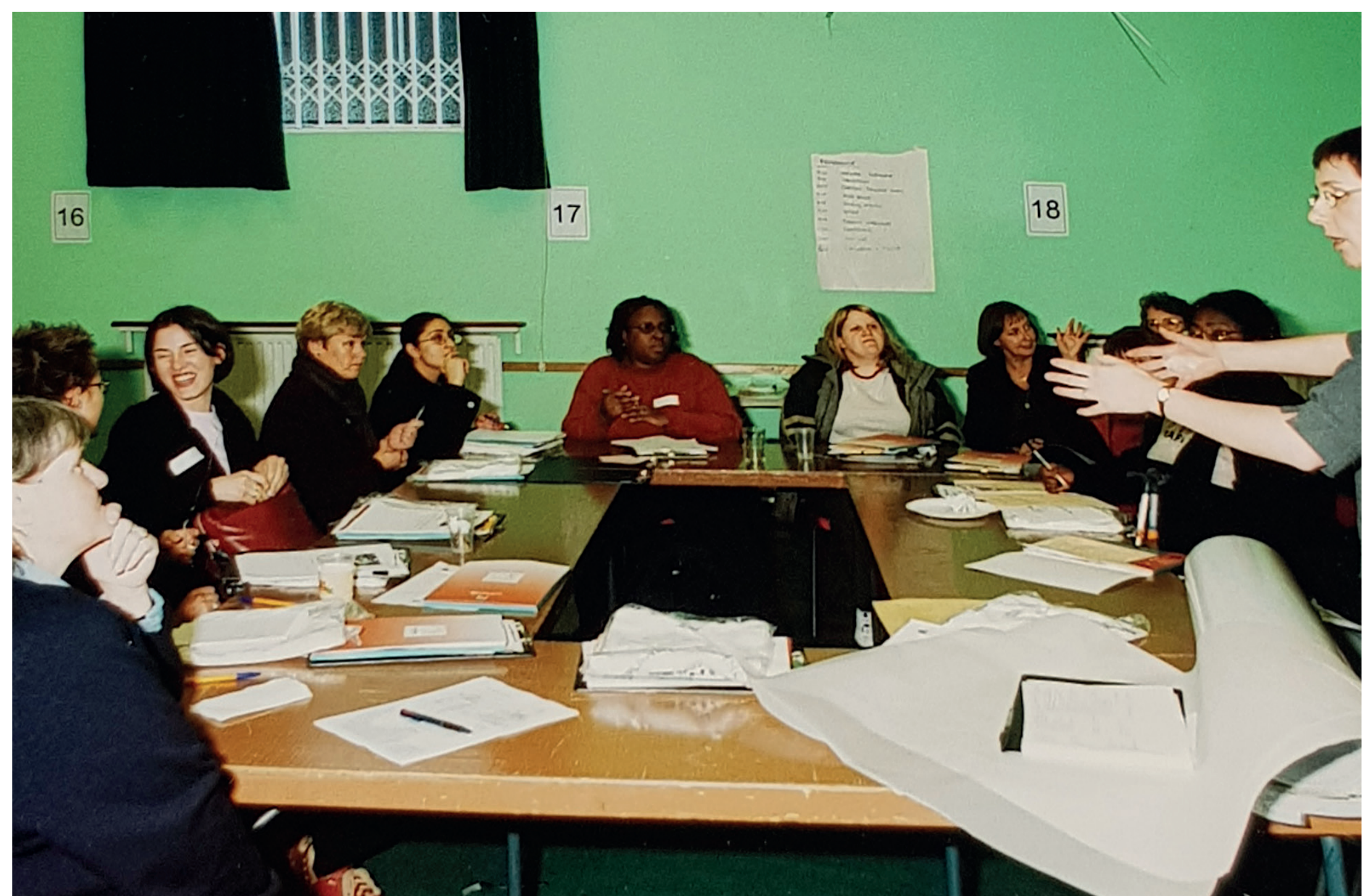
Women in Planning.

A female City Council planner describes how "women and planning was in the air at the time" , and in the 1990s a small pot of money was given to the planning department to form a Women in Planning consultation group to promote women in planning. The City Council also provided some funding for BfP Women's Group and set up womens' participatory planning events via their Women's Unit (1981 -1997).