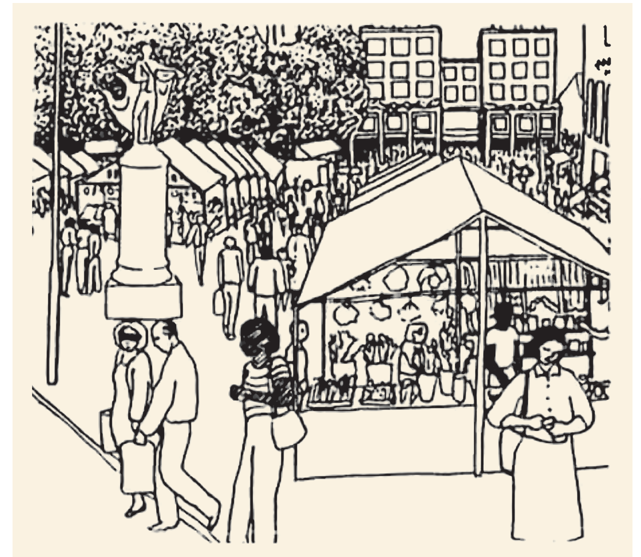
BfP Newsletter header (1990-1993)

To build influence and access resources, BfP Women's Group were key players in alliances involving the City Council, such as the City Council Women's Unit, Department of Planning and Architecture, the Community Safety Unit and Safe Estate for Women (SEW).