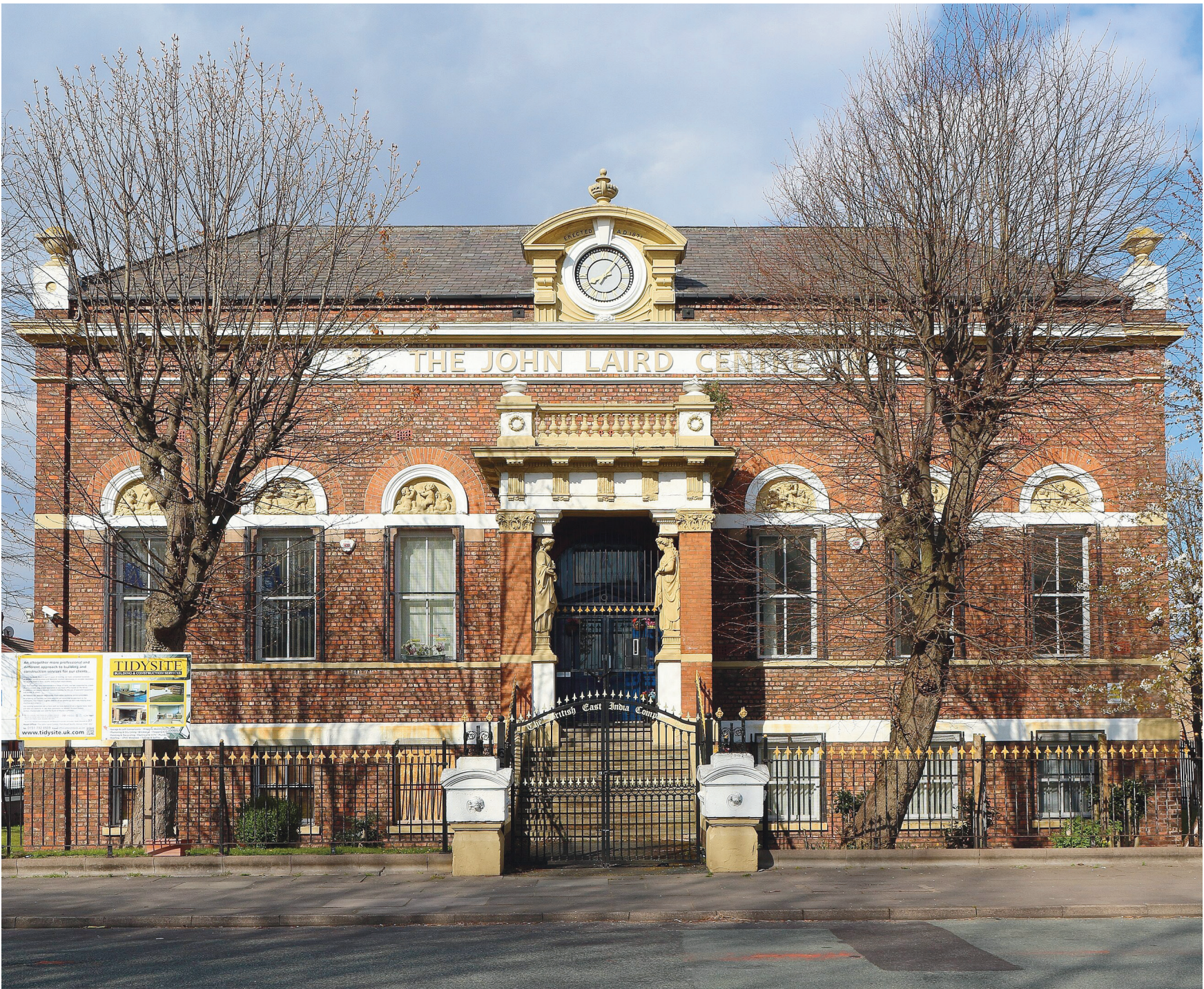
The Birkenhead School of Art (now The Laird Building), 2019.