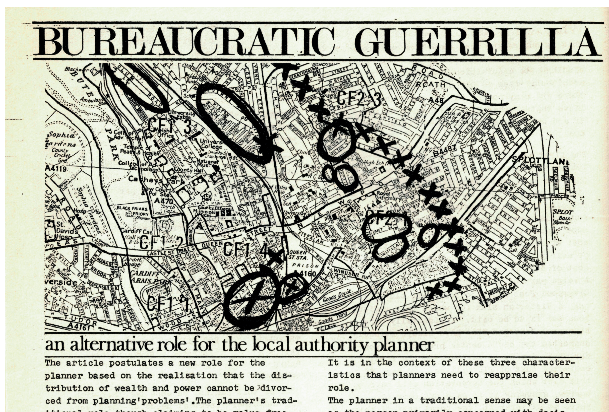
Article from Community Action No. 1

Designed to be punchy and engaging, CA provides rich insight into oppositional community action, from the gradual disintegration of the post-war settlement in the early-1970s to the privatisations and individualism of the 1980s.