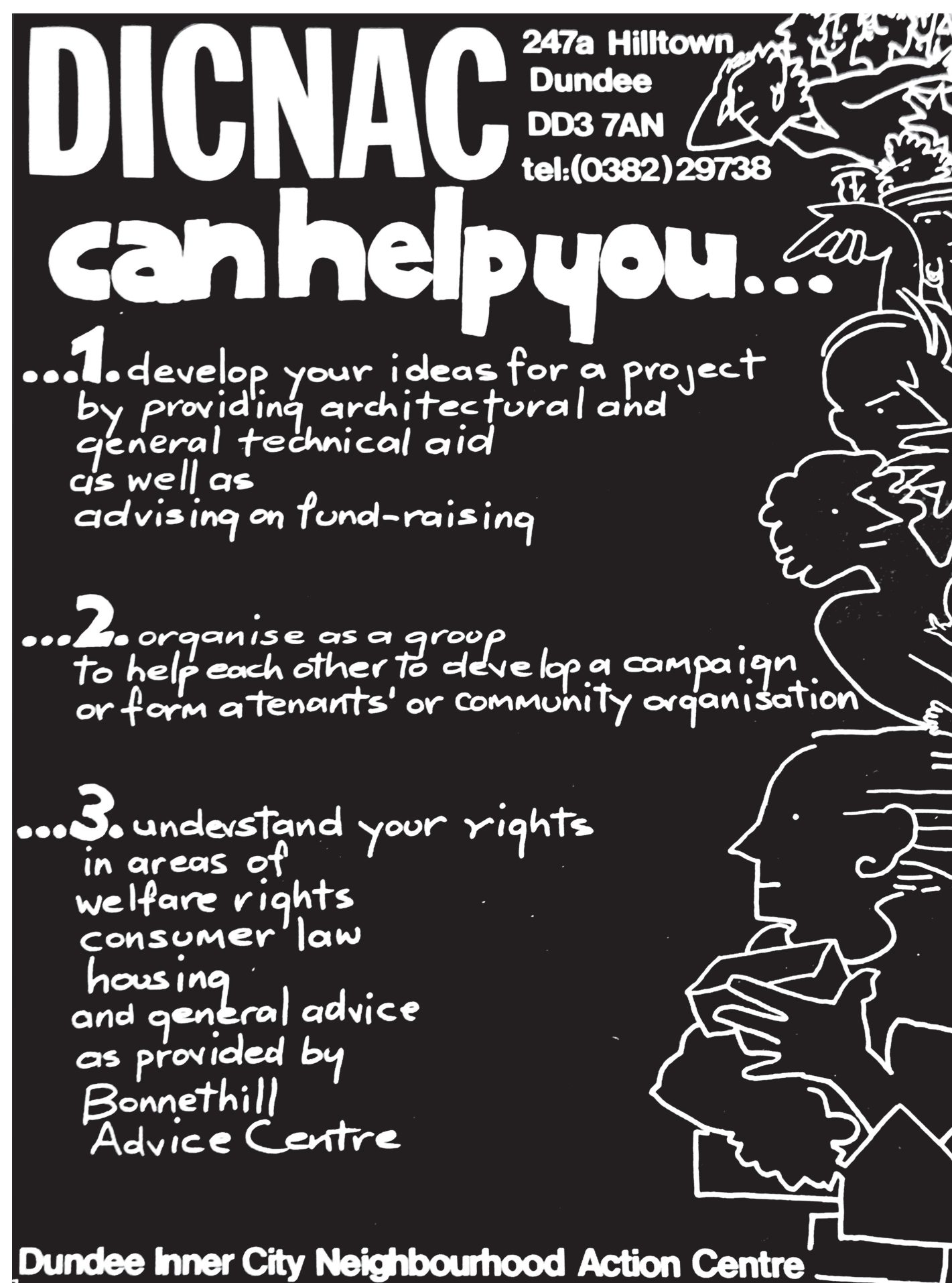
Poster advertising DICNAC.