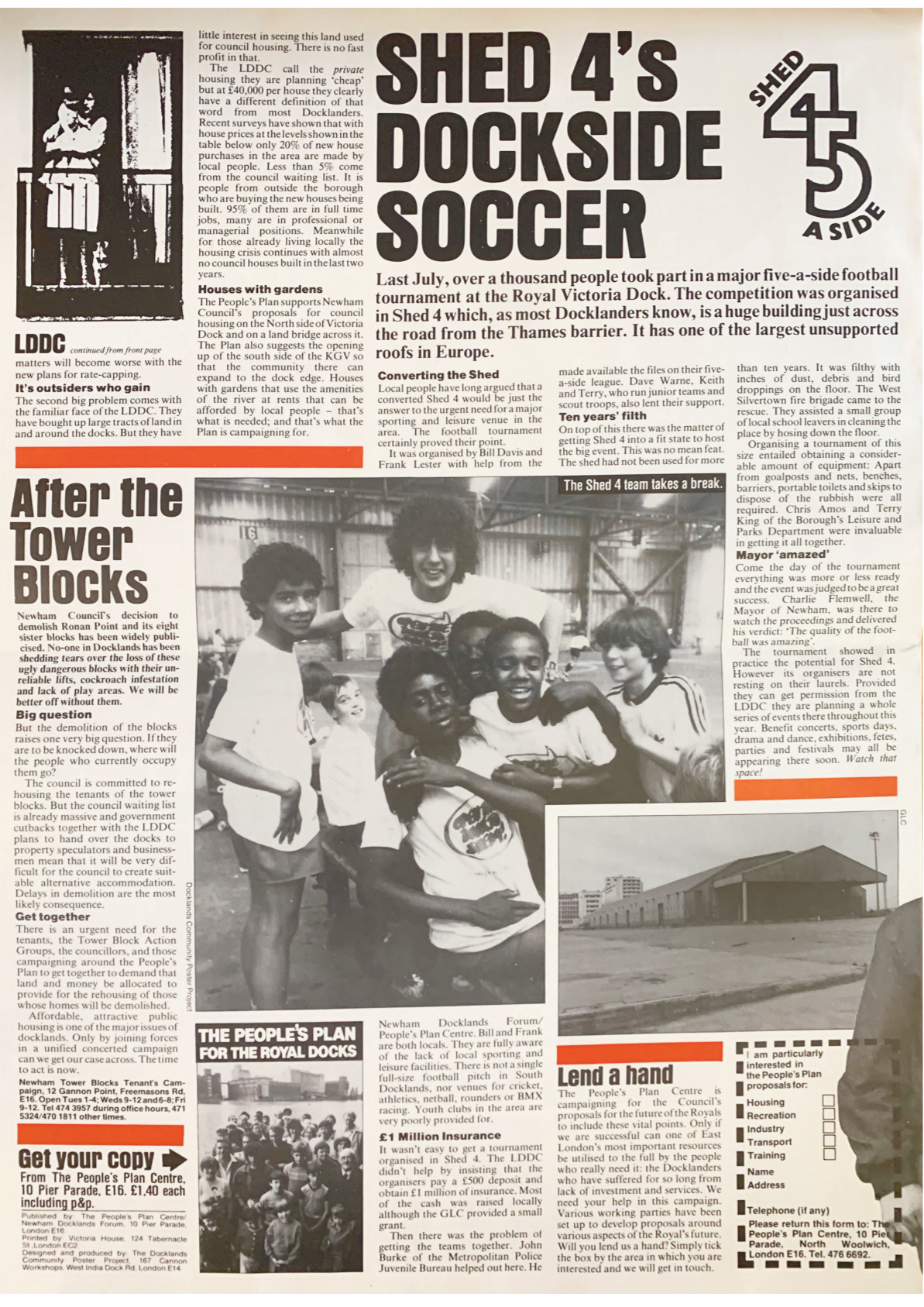
JDAG archive at Museum of London in Docklands

A 5-a-side soccer tournament was held in Shed 4 to show how it could work as a sports centre. The shed was demolished and the site is still empty in 2023.