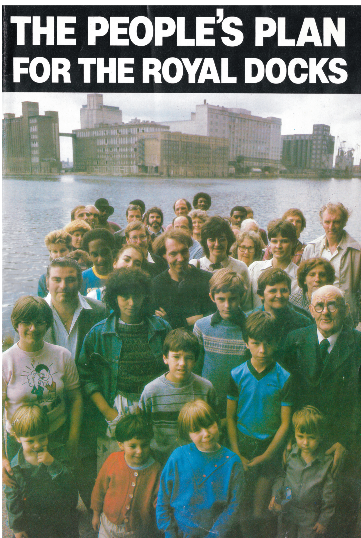
Newham Docklands Forum People's Plan 1983