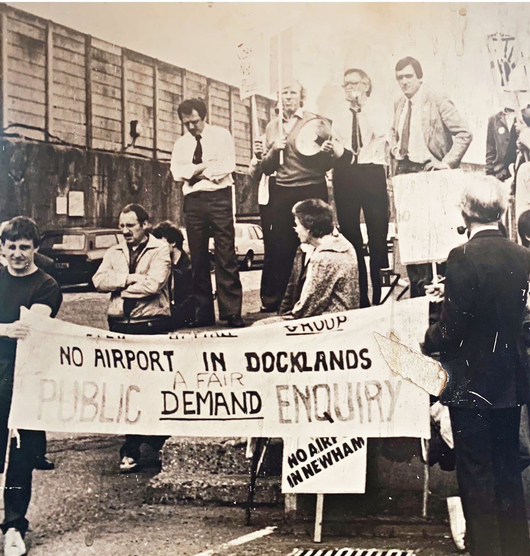
Opening day of the STOLport Inquiry at the Albert Dock Basin June 8th 1983