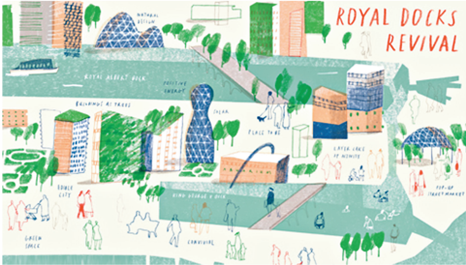
New Economics Foundation

This and other community-led plans have inspired later projects, planners and activists. In 2014 Royal Docks Revival (pictured below) set out a sustainable neighbourhood vision as an alternative to one of the many expansions to the airport. Communities in Canning Town and West Silvertown are developing their own buildings and plans. Today's planners still refer to it.