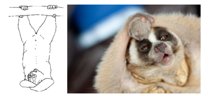
Figure 1. Drawing of a slow loris engaged in the venom pose and photo of a loris held by a researcher with the arm positions of the venom pose; the arms are held tightly clasped above the head allowing the animal to mix saliva with oil from their upper arm brachial gland.

lorises display a promiscuous mating system and lack a breeding season. This allows males more opportunities for contests and, therefore, results in higher rates of wounding [11,32].