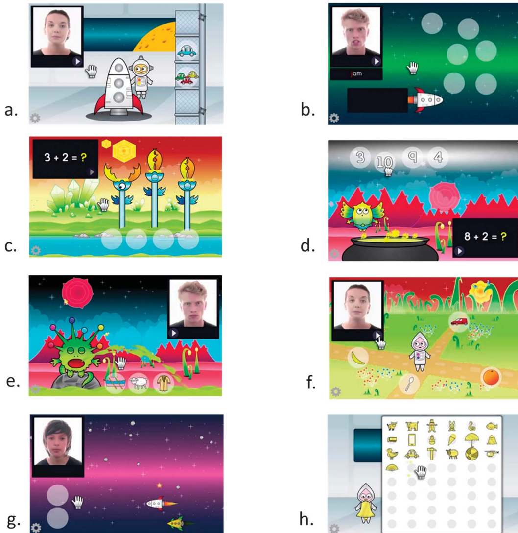
Figure 2. Screenshots from each of the seven computer games (a–g) that were used in the intervention and control conditions of the trial and from one of the reward scenes (h). Example content from both the speechreading and number and maths interventions is shown in the seven games. Note that stimulus (speech video or math problem) and targets (pictures, letters, or numbers) did not typically appear on the screen at the same time (except in Figure 2d), hence the appearance of the screenshots.

Children received two scores on this measure, one reflecting the number of questions on which they correctly reproduced the gist of the sentence (ToCS Everyday Questions Items Correct Gist) and one reflecting the total number of individual words that the child got correct across all 12 questions out of a possible 62 (ToCS Everyday Questions Words Identified).