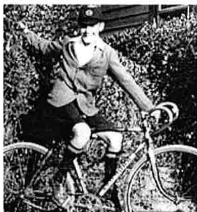
At Collingwood Technical College, 1935.

I think my parents' idea was that I would become a white-collar worker rather than a labourer, so they encouraged me to become a draughtsman. I went off after primary school to a technical college for about two years, but it wasn't a great success. I was not a very good artisan, I'm afraid. I could never keep the drawing paper clean, I made an electric iron that didn't work, and all sorts of things like that.