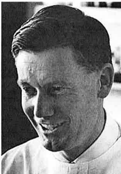
At the John Curtin School of Medical Research, 1971.

Yes, and I think that the bacterial work that we did – and that a lot of others have done since then, because it became fashionable to work on E. coli and quite a number of labs took that up with oxidative phosphorylation – has given a lot of insights into the process which had been used by people in the eukaryotic field to work on their aspects of it. E. coli is a wonderful laboratory tool because you can work so quickly and easily with it and get results.