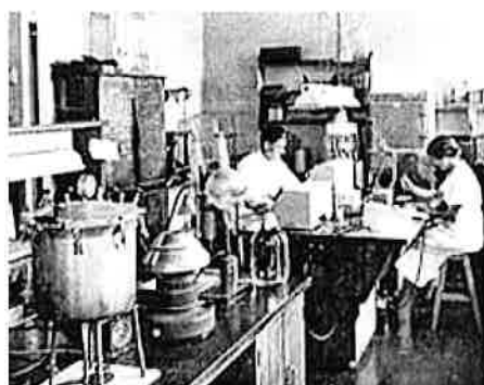
Bacteriology Department, University of Melbourne, 1958.