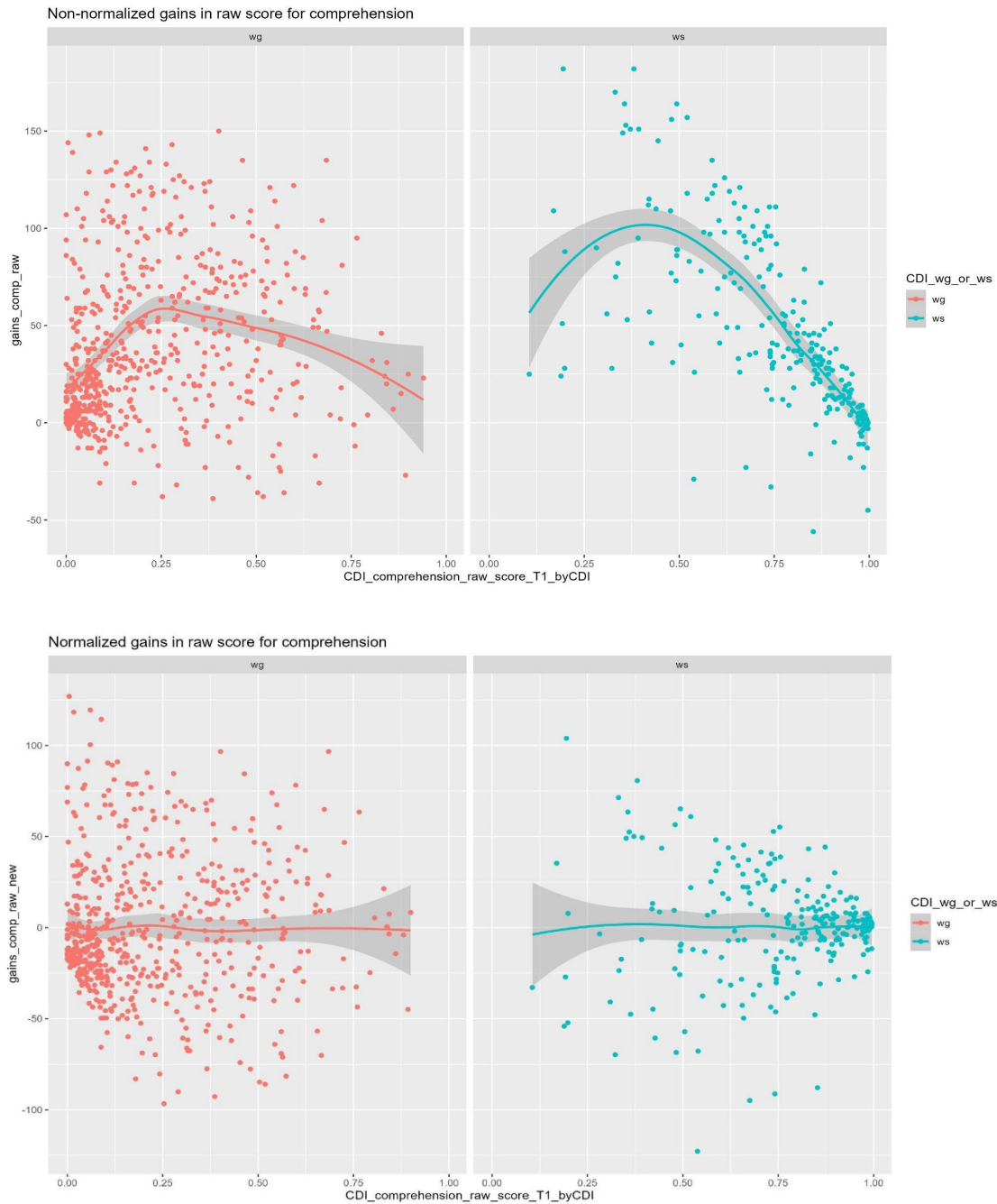
Figure 1. Non-normalized (top) and normalized (bottom) gains in comprehension vocabulary as a function of the adjusted CDI score at T1 for the CDI tools Words and Gestures (wg) and Words and Sentences (ws). See Analyses_2.Rmd code on https://osf.io/ty9mn/ for data on production.