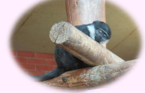
Tumba Mid-Ranking Female 20/4/2020