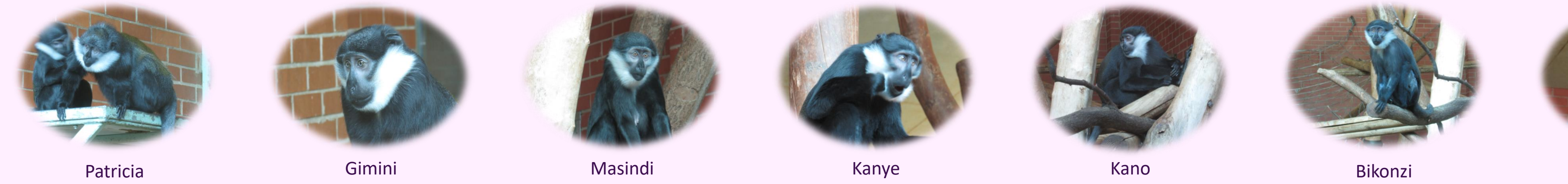
Lowest Ranking Female 5/12/1999

<sup>1</sup>Oxford Brookes University MSc 2022/2023 <sup>2</sup>Oxford Brookes University