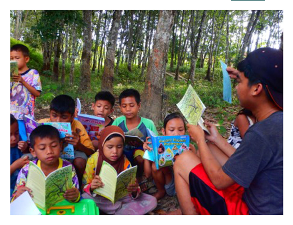
FIGURE 2 Children in Indonesia reading the Little Gibbon Book.

change takes time (years) to filter through and be measured, thus we sought to focus initially on engagement with the resources and knowledge gain. Using a combination of books, mobile phone apps and mobile phone games, BNF is working to reach a wide audience both in Indonesia and around the world to engage people with the plight of gibbons and to inform positive conservation actions. The traditional medium of a physical book complemented by an enhanced supporting app as well as an augmented reality mobile phone game allows users to experience gibbon conservation and actions in a variety of accessible formats. At the heart of these tools are the song of the gibbons-using the spectacular acoustics of these species to engage the general public through science and sharing the work of BNF as well as promoting the science, conservation and traditional local stories, myths and legends of gibbons to a new audience. Thus, we propose the idea that using the science and stories of gibbon vocalizations can enhance the NGO communication efforts.