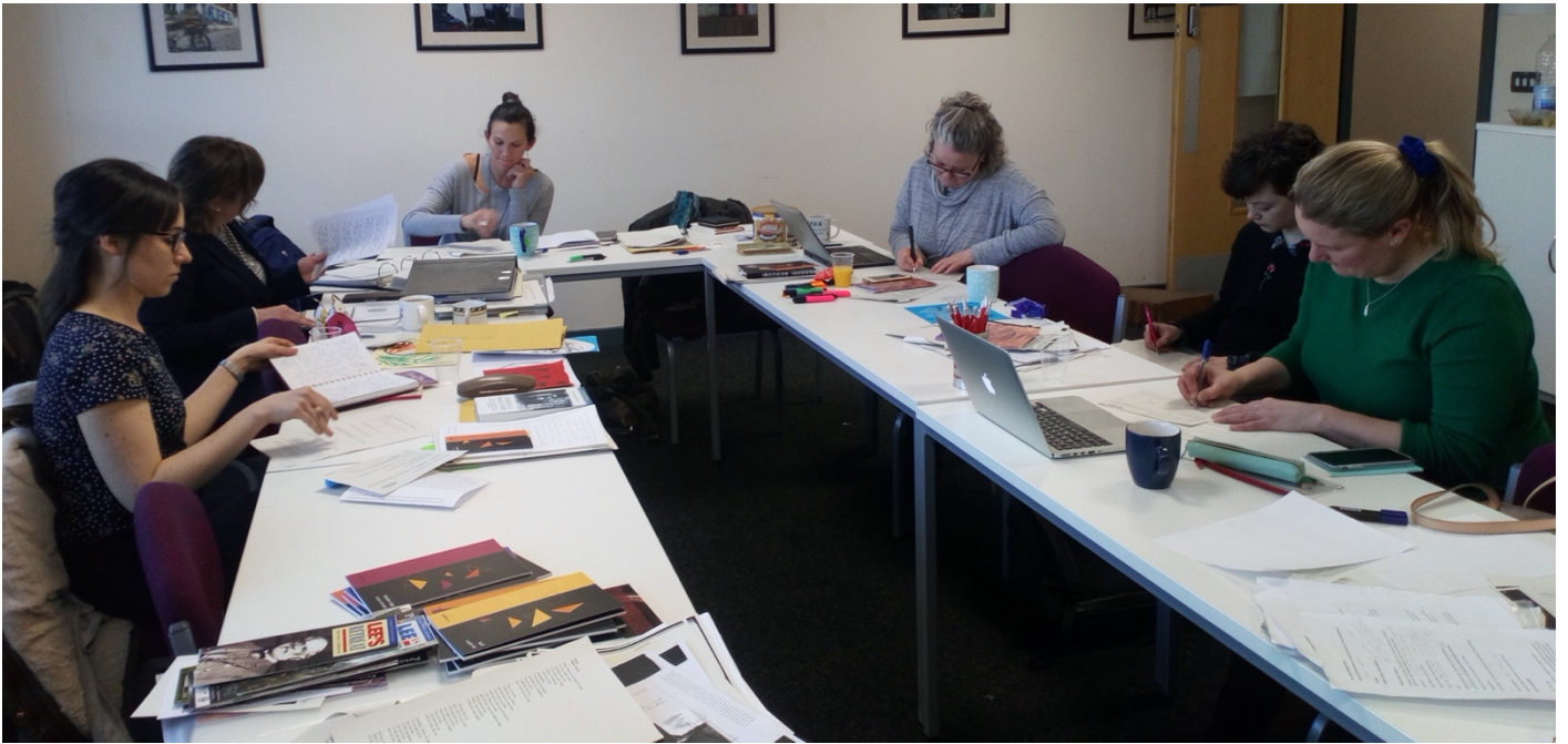
During the all-female workshop, five participants and a workshop leader work individually to develop written pieces.