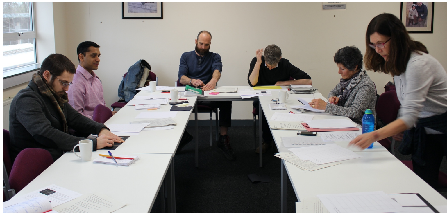
Five workshop participants and a workshop leader take part in one of the sessions about visual prompts for writing.