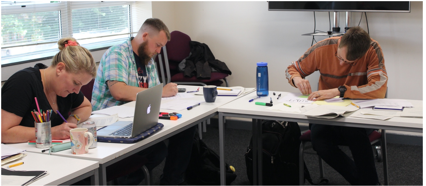
Three participants work on pieces individually during a session of writing time as part of a workshop.