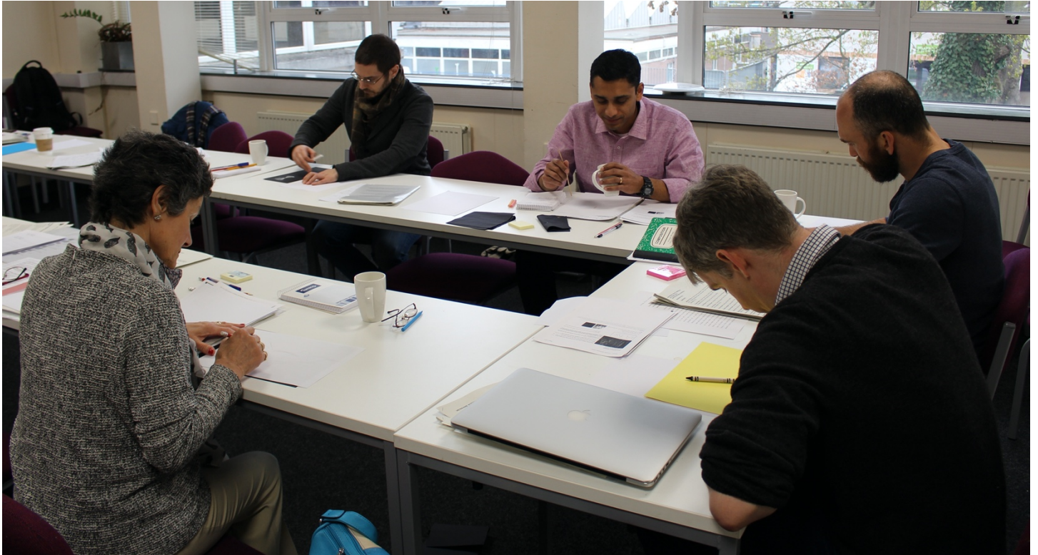
Five participants experiment with watercolours, crayons, chalk, charcoal and other media to present their writing and thoughts in different ways to just text.