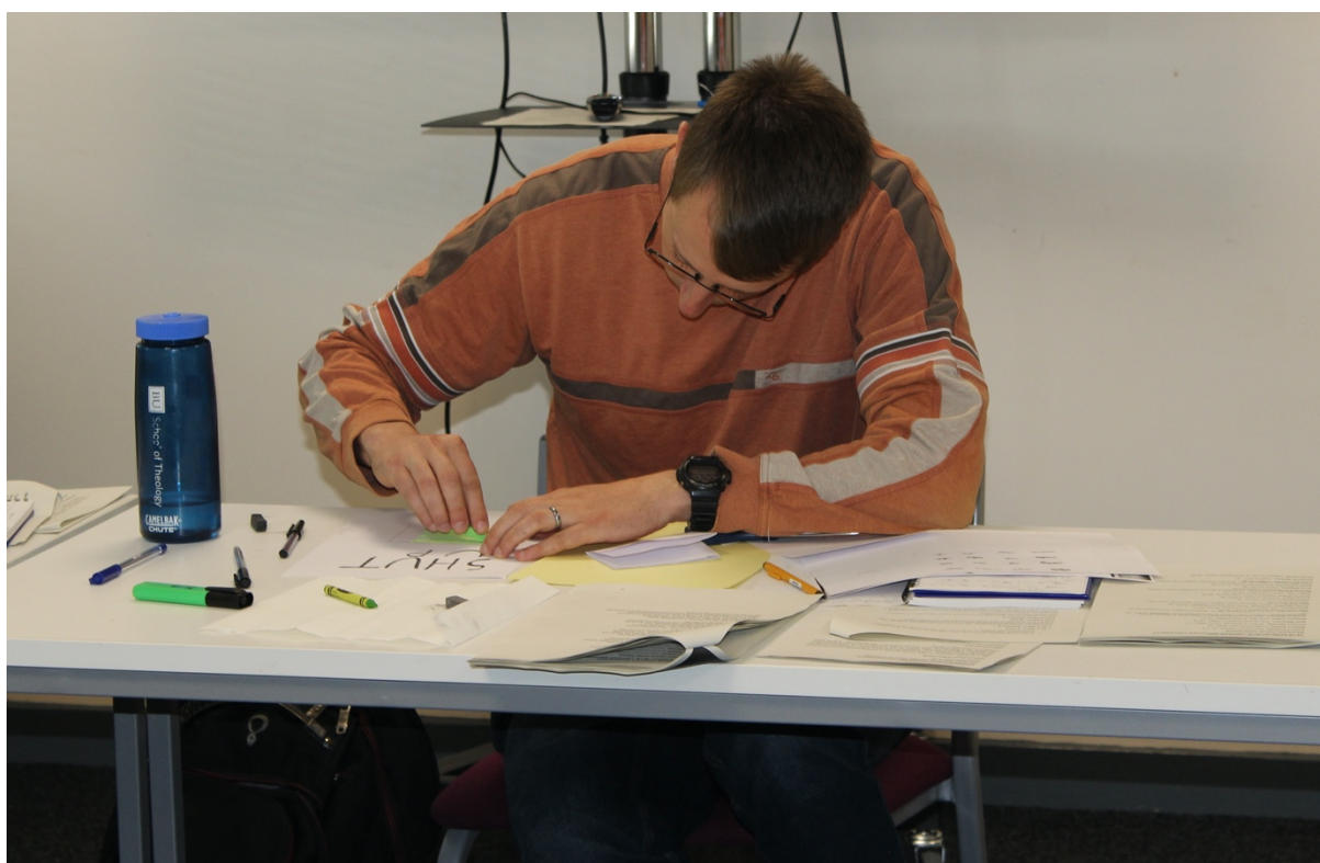
A participant works on a piece during the workshop using crayons and text.