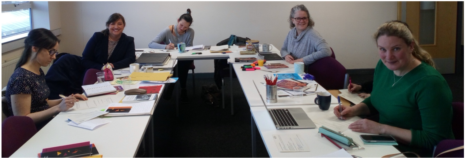
During the all-female workshop, four participants and a workshop leader work on their written pieces or reflections.