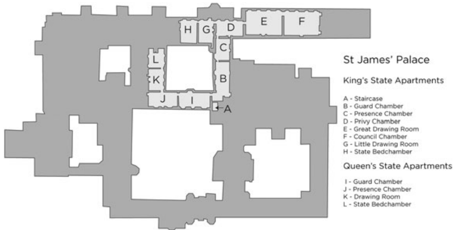
1. Plan of the State Apartments at St James's Palace. © Laura Chilton/Historic Royal Palaces

space, leaving only the closet for the king's private business'. 26 This article focuses chiefly on rooms that courtiers could reasonably expect to enter during a 'drawing room': the Great Staircase, Guard Chamber, Drawing Room, Gallery, Privy Chamber and Withdrawing Chamber. To limit the vast source material available, the article excludes outdoor spaces such as gardens and courtyards. Our 'State Apartments' do not include bedchambers, closets and private apartments in which the king and queen would not expect to 'appear' before their courtiers, as they did at functions in the outer rooms. 27