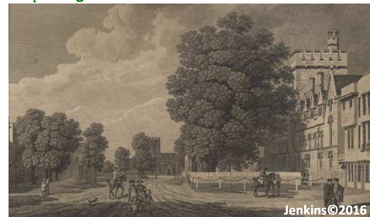
Stop 5: Figure 2 - 1779 Print of St Giles Street Trees