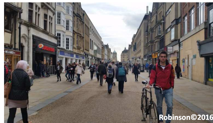
Stop 3B: Figure 1 - Add some trees to Cornmarket