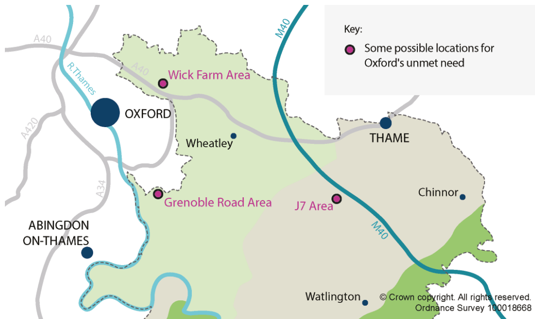
Figure 3: Grenoble Road area