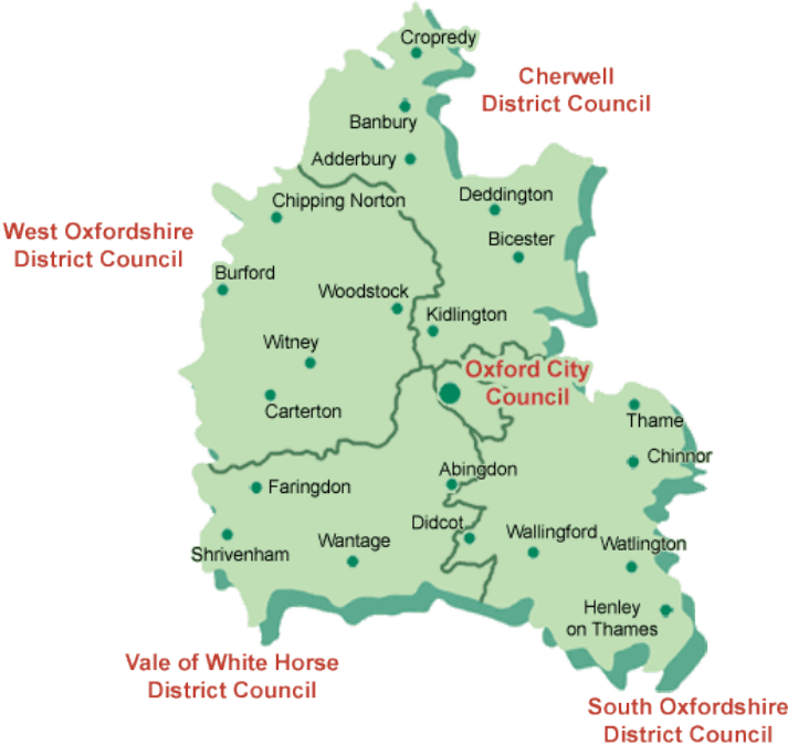
Figure 2: Oxfordshire County and Districts