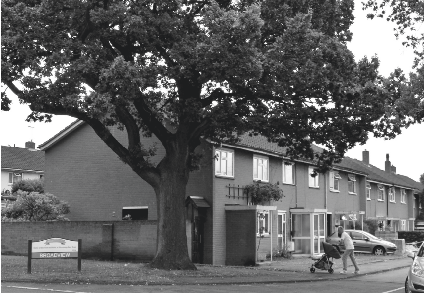
Figure 5.6 The first houses completed (in 1951) at Stevenage New Town at Broadview, off Sish Lane in the Old Town neighbourhood. Then, mothers had to push their children's prams and pushchairs through the mud of a construction site. This is now a much easier task and such family duties are more likely to be shared between mother and father. (author photograph)