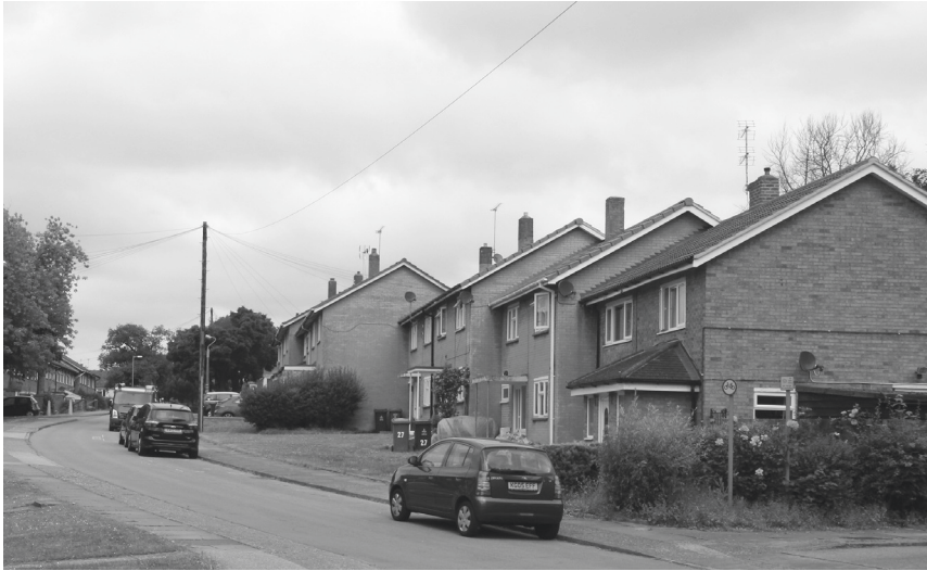
Figure 5.5 Early houses built by the Development Corporation on the Stony Hall estate in Neighbourhood 1 (Old Town), completed in the early 1950s.

a year-by-year basis to do it. By 1952 about a third of the designated area had been bought by the Development Corporation and by 1960 roughly half. By 1980, when the Development Corporation was wound up, about four-fifths of the designated area had been purchased. It was estimated that about two-fifths of acquisitions had involved compulsory powers.