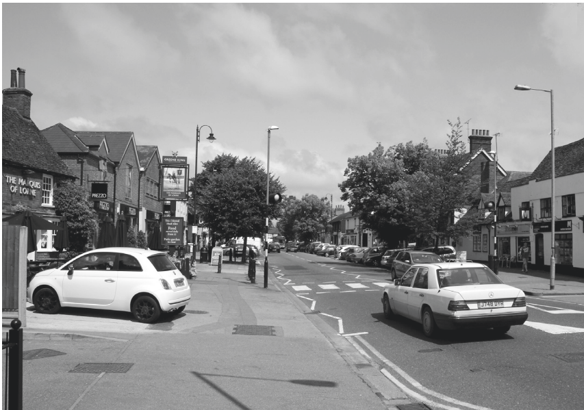
Figure 5.7 The historic environment of the Old Town itself was largely unaffected by the New Town. There has been some limited redevelopment of individual buildings but the main changes have come from the longer-term growth of motor traffic.

From 1952 the first completely new neighbourhoods began to take shape, first at Bedwell and shortly afterwards at Broadwater and Shephall. 64 Unlike in the case of the first neighbourhood, focused on the Old Town, existing building development had very little impact on their layouts. At Shephall, the tiny existing village at Shephall Green remained around its church and small green as a striking contrast with the quite new residential pattern which was inserted around it. But this relic feature of a former rural landscape was exceptional: a protected historic enclave within the new neighbourhood that took shape around it.