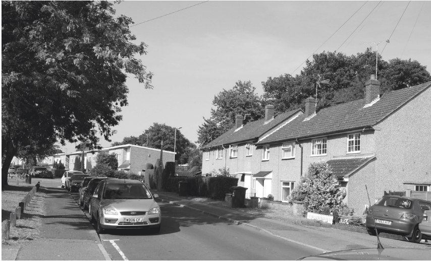
Figure 5.8 The Broadwater neighbourhood began to be built from 1953. A common house type was the PP77 short terrace built by Wimpey using their no-fines concrete system. Another was the C23 flat-roofed house, shown beyond. Compared with the first housing, there are more signs of a search for economies, though the failure to provide for cars is common in all early schemes.

One of the first entirely new neighbourhoods, Broadwater, begun in 1953, typified these earlier residential areas in the boom years of housing output. 65 In line with the original 1949 master plan, it was planned at just over 12 dwellings per acre (30 per hectare). The first contract comprised 150 Wimpey no-fines three-bedroomed terraced houses of the Development Corporation's PP77 standard type (Figure 5.8). 66 This housing type was essentially a variation of a standard Wimpey design and similar in appearance to houses developed elsewhere at the same time. With a pebble dash cement surface finish, the houses are mainly arranged in straight rows of six or eight dwellings fronting the estate roads in a conventional manner. There were small open front gardens with a pavement and a very narrow grass verge with no street trees. Larger enclosed gardens were provided behind the houses. The area typifies the plainness of many neighbourhoods built in Stevenage and other New Towns when the pressure to produce more houses was growing.