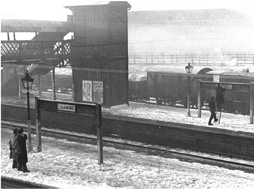
Figure 5.4 Shortly after Stevenage New Town was formally designated in December 1946, local protesters replaced the station name-board with the name 'Silkingrad'. Donations to the Residents' Protection Association flowed in as the campaign was publicised nationally and internationally.

Clough Williams-Ellis remaining as chairman. He was an architect and Welsh landowner who created the fanciful village of Portmeirion on his estate, a fact which frightened some who feared that Stevenage might suffer the same fate. He was also a charismatic advocate of the idea of planning and of rural protection. Yet he was not a natural chairman of any New Town, let alone one that would be able to do almost nothing for several months.