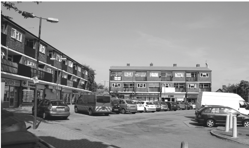
Figure 5.9 Broadwater neighbourhood shops, built in 1957, with flats above. Nearby are a church, a pub, flats and old people's housing, providing a central point within a large neighbourhood. Over time, more parking provision has been needed and what were originally several small food shops have become one convenience supermarket.

As more housing appeared and families arrived, local primary schools were added on sites within housing areas. The shops came a little later and, after local complaints, six then unoccupied houses on Broadwater Crescent were opened as temporary shops with a small Co-op in a caravan parked across the road. 67 Broadwater's heart was a local three-storey shopping centre (mainly of brick) built in 1957, with small ground-floor shop units and flats above (Figure 5.9). It was arranged in two blocks, with a new neighbourhood church (built in 1955) forming the third side of an enclosure facing one of the main neighbourhood roads. The area between the buildings contained a small paved pedestrian precinct, a grassed area and some car parking spaces. Adjoining the shops was a public house (also built around 1957). In 1968 a six-storey brick-faced block of flats for elderly residents was added and in 1971 some single-storey housing for disabled residents in brick and timber. A local health centre was opened at about the same time.